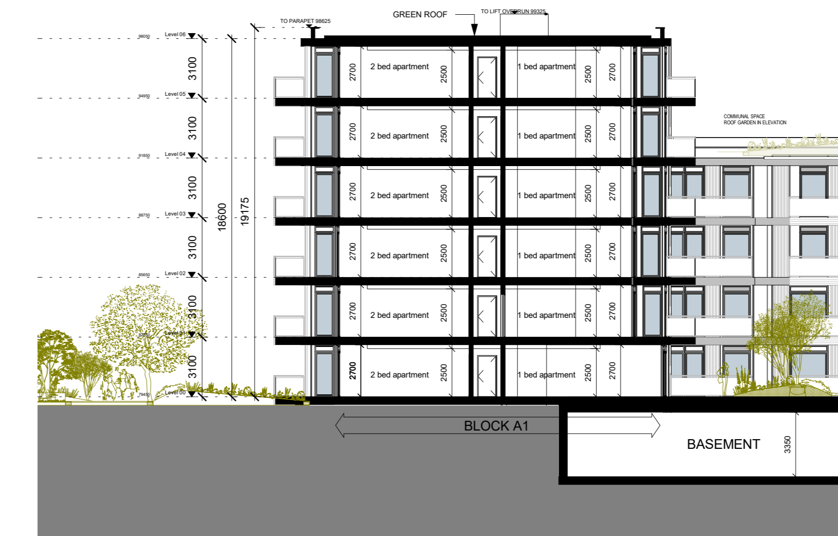
6 Block A1 Proposed Section 02 1 : 200