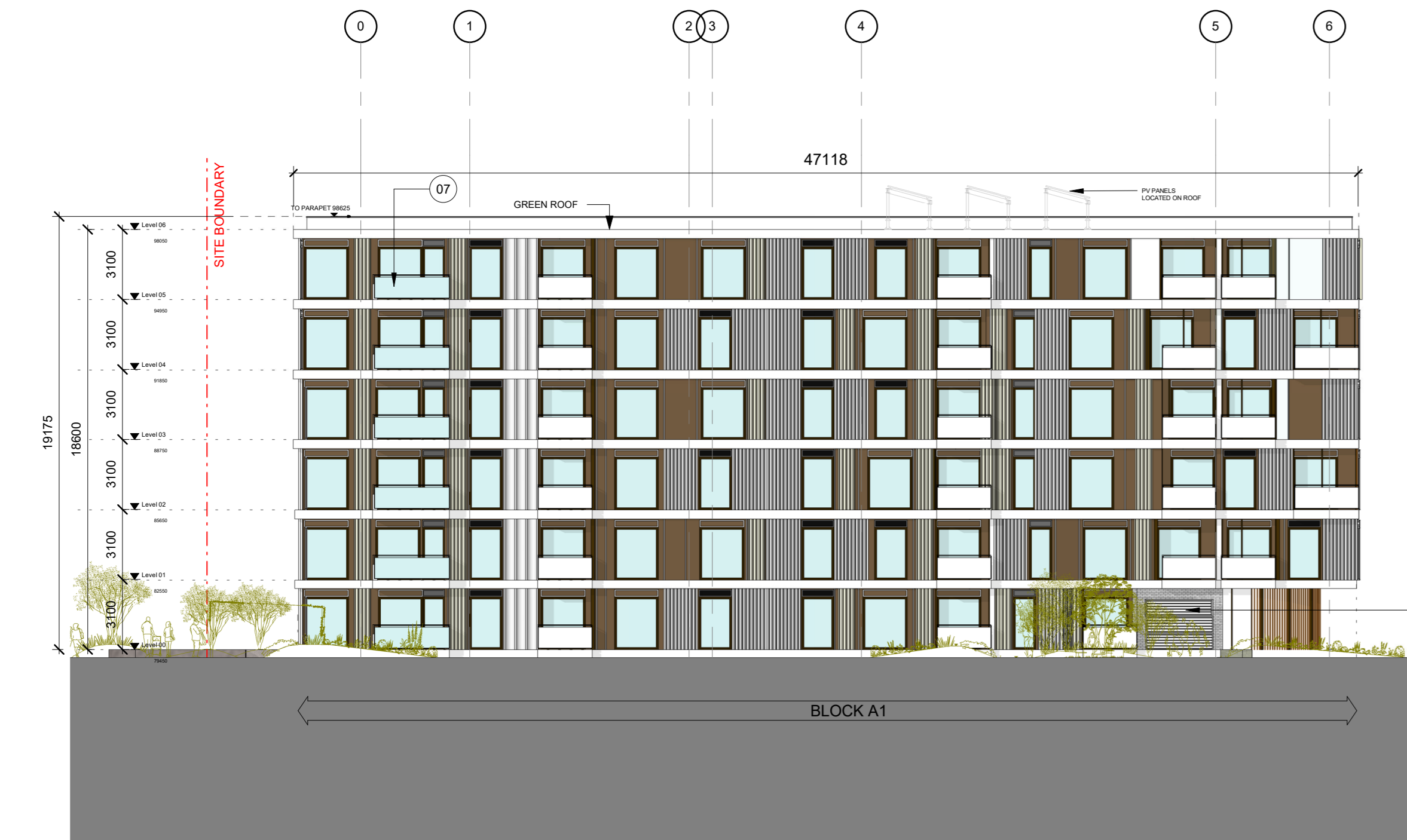
2 Block A1 Proposed Elevation 01 1 : 200