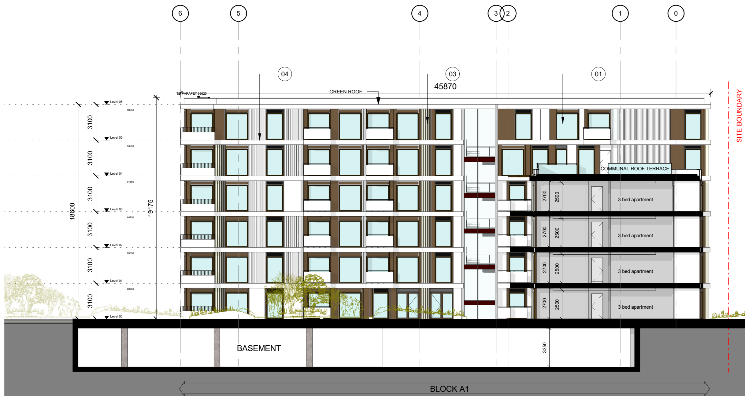
1 Block A1 Proposed Elevation 03 1 : 200