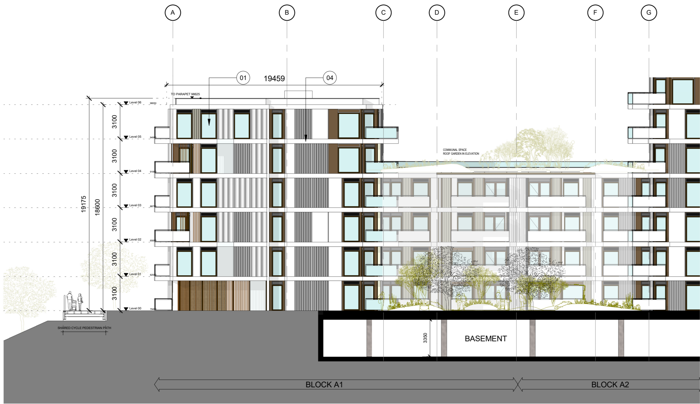
3 Block A1 Proposed Elevation 02 1 : 200