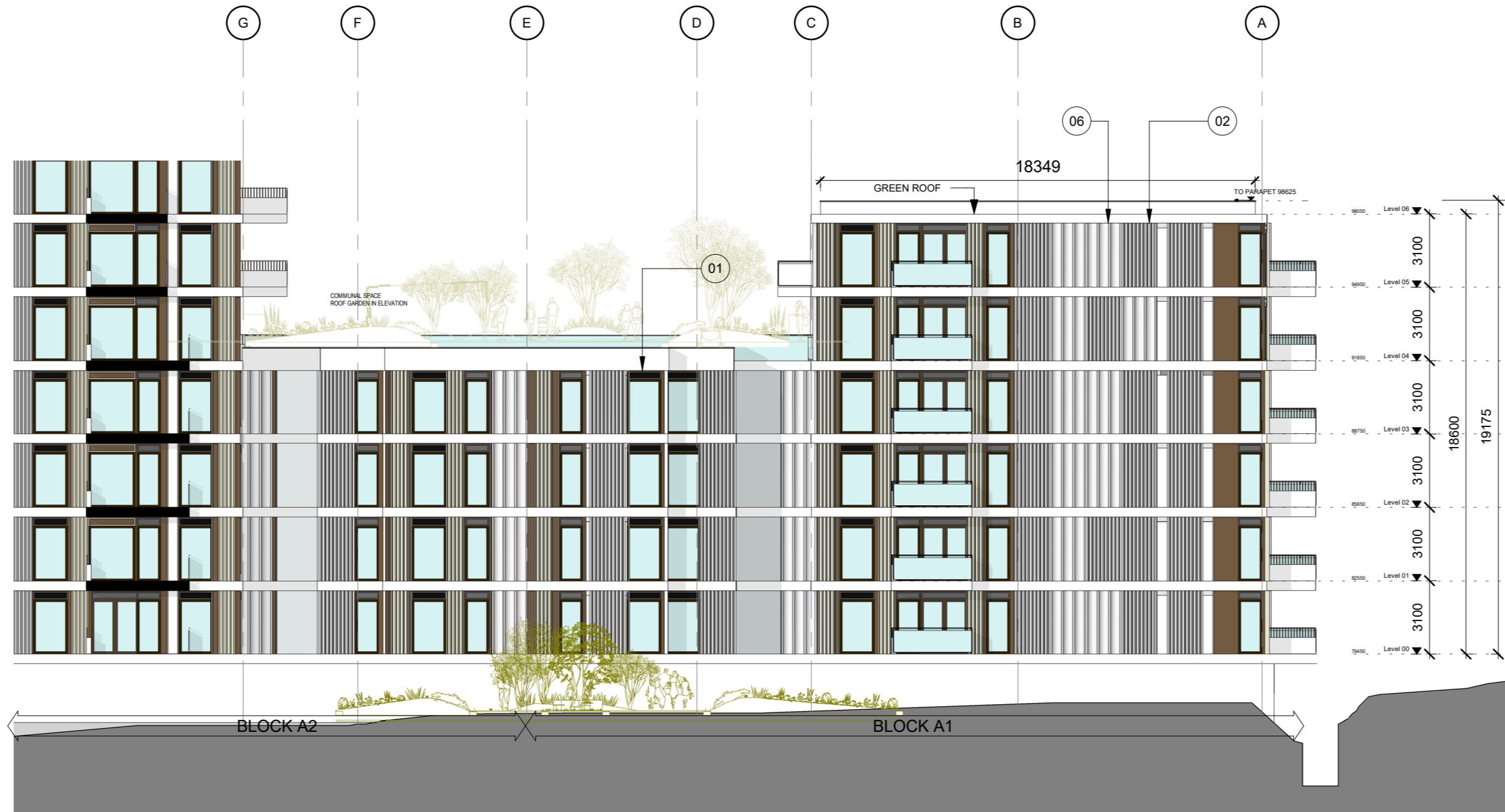
4 Block A1 Proposed Elevation 04 1 : 200